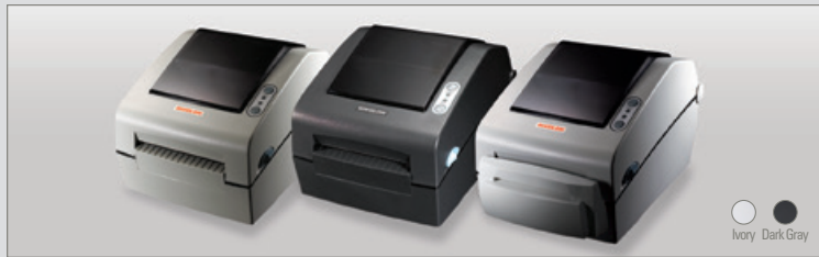
SLP-D420 (Standard Type)